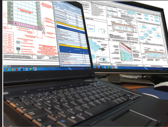
Free Design Assistance